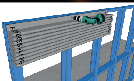
Installing the TBA Firefly™ Plus 60 RS to the steel frame

TBA FIREFLY™ AS1530.8.2 BAL-FZ WALL SYSTEM