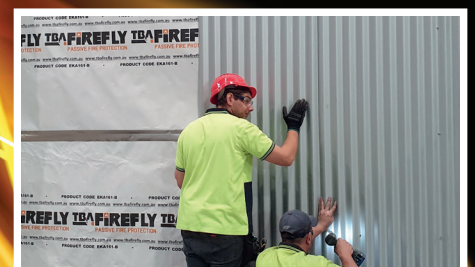
TBA Firefly™ Non-Combustible Sarking & Steel Sheet Cladding