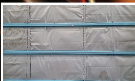
TBA Firefly™ Plus 60 RS & Steel Top Hats