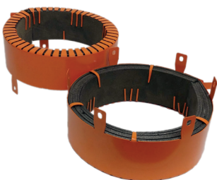
FRF 150 Fire Collars