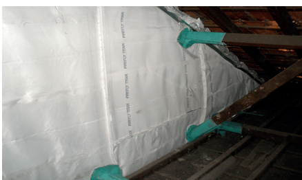
Strata Unit Subdivision NSW