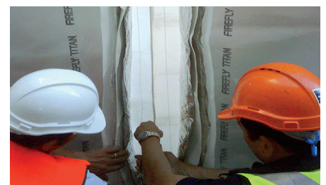
Titan Vertical Seam